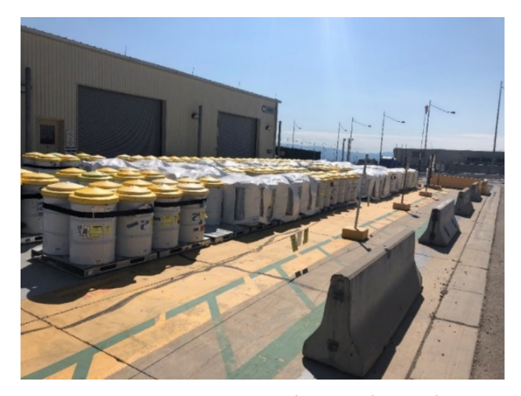
Figure 1. LANL's HENC Pad Located Outside PF-4

Transuranic Waste Facility—TWF stores, characterizes, and performs intra-site shipping of newly generated transuranic waste. This facility, which began operations in late 2017, stores waste inside multiple buildings. Each building has a fire suppression system that could help mitigate the dose consequences from an energetic chemical reaction, however the buildings do not have continuous air monitoring or a confinement ventilation system.